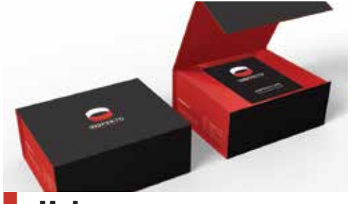
Unbox All INSPEKTO S70 components come packed in one practical box