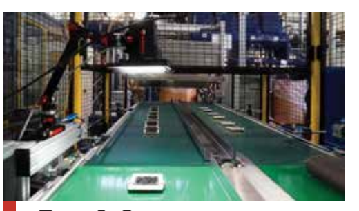
Run & Gun Every INSPEKTO S70 comes ready to connect to your PLC, out of the box. Serve it 30 good samples while you link it to your PLC – and you're done...

INSPEKTO WORLD'S FIRST AUTONOMOUS MACHINE VISION SYSTEM