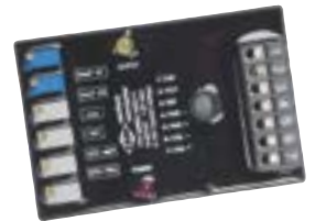
B5950 Series Block Micro Proportional Drivers