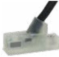
9D Series Reed & Electronic Sensors for Universal Applications