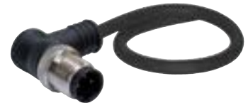
12mm 90° Molded Locking Connectors