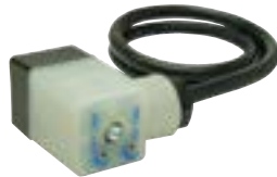
5800 Series MINI & ISO Micro Logic Timers