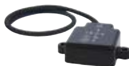
EiS Series J1939 and CANopen Electronic Inclinator Sensors