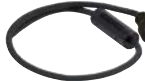
5FMSD Series Fully Molded In-Line Micro Solenoid Driver Power Converter