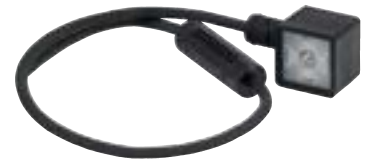
5JMSD Series Fully Molded In-Line Micro Solenoid Driver Power Converter