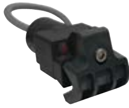
7C Series Reed and Electronic Sensors for Tie Rod Cylinders