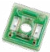
iLW MINI, ISO, & Sub-Micro Interposed Lighted Wafers