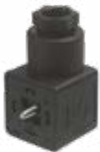
5000 Series MINI, ISO, & Sub-Micro Field Wireable