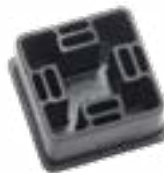
DCP MINI, ISO, & Sub-Micro DIN Coil Protectors