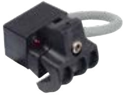
7000 Series Reed and Electronic Sensors for Tie Rod Cylinders