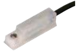
9E Series Reed & Electronic Sensors for Universal Applications