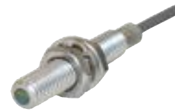
CS Series All Threaded Magnetic Sensors for Universal Applications