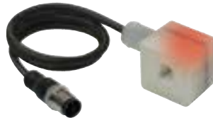
5JFAC Series MINI, ISO, & Sub-Micro Fully Molded Fieldbus Adapter