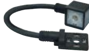
MCCR Series ISO Fully Molded Multiple Control