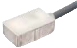
8000 Series Reed & Electronic Sensors for Round or Tie-rod Cylinders