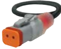
GT 2 Pin Series Molded Receptacle and Plug Connectors