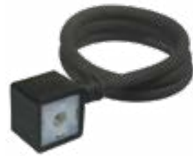
5K Series ISO Fully Molded