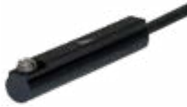
9C Series Reed & Electronic Sensors for Round Keyway Groove