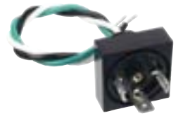
M5 Series MINI, ISO, & Sub-Micro Male