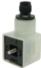
FAC Series MINI & ISO 12mm or 7/8" Fieldbus Adapter