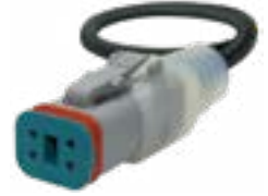
GT 4 Pin Series Molded Receptacle and Plug Connectors