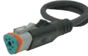
GT 3 Pin Series Molded Receptacle and Plug Connectors