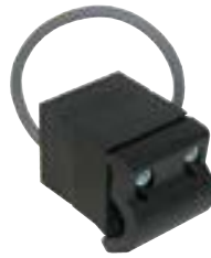
7GL Series General Location Magnetic Proximity Sensors for Tie Rod Cylinders