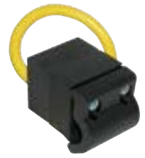
7HL Series Hazardous Location Magnetic Proximity Sensors for Tie Rod Cylinders