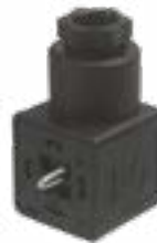
P5600 Series MINI, ISO, & Sub-Micro Micro Protective Surge Suppression