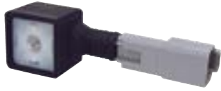
5JGT Series DIN to GT Adapter