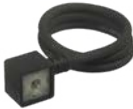
5J Series MINI, ISO, & Sub-Micro Fully Molded