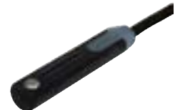
9M50 Series Reed & Electronic Sensors for 6.5mm "D" Groove