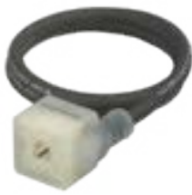
5F Series MINI, ISO, & Sub-Micro Fully Molded