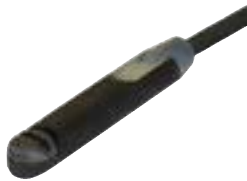
9Q Series Reed & Electronic Sensors for Universal "T" Slot