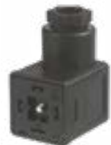
R5000 Series ISO Field Wireable Rectified