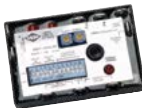
MBT Series Multifunction Block Timers