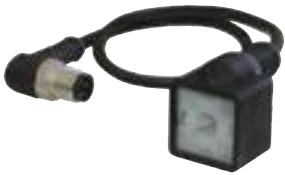
5FFAC Series MINI, ISO, & Sub-Micro Fully Molded Fieldbus Adapter