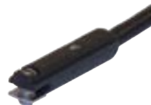
9K Series Reed & Electronic Sensors for 4.2mm "U" Groove