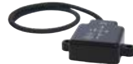
ETS Series Electronic Tilt Switches