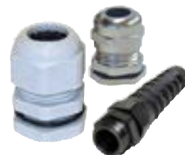
CanGrip Strain Relief Cord Grips