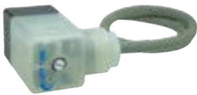
D5400 Series MINI & ISO Micro Solenoid Drivers