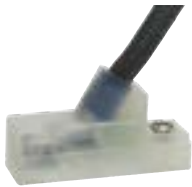
9F Series Reed & Electronic Sensors for 4mm "T" Slot