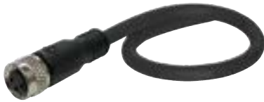
8mm Molded Locking Connectors