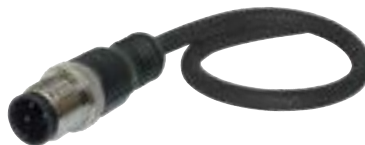
12mm Molded Locking Connectors