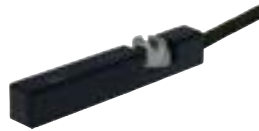
9U Series Reed & Electronic Sensors for "T" Slot